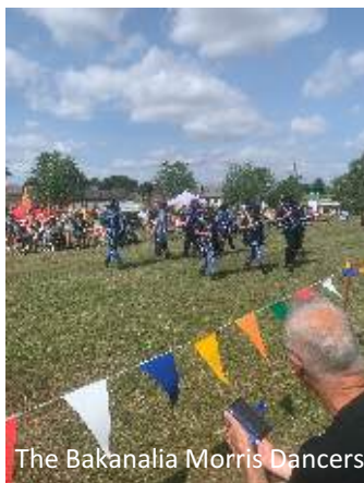
The Bakanalia Morris Dancers

Show entries were up again this year, and it was great to have some scarecrows outside the marquee.