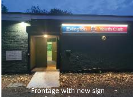
Frontage with new sign

Following on from the 'Volunteer It Yourself' (VIY) advertisement, which was published in the Evington Echo magazine for August/September, here are some pictures showing the Youth Club now after 2 weeks of refurbishment.