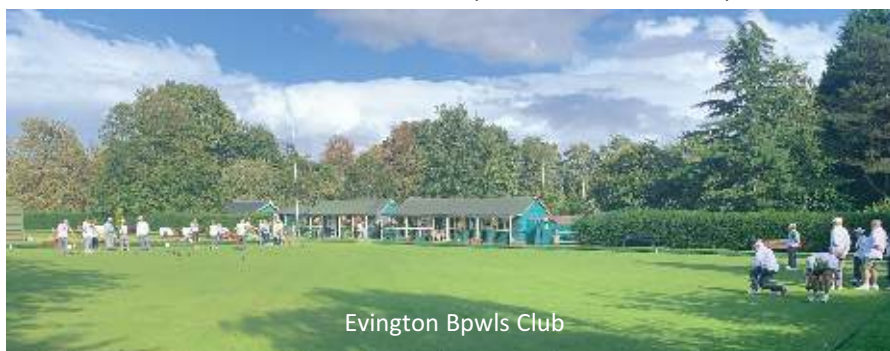
Evington Bpwl's Club