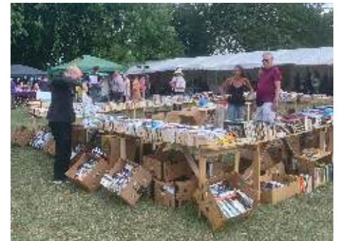
The Book Stall at the Fete and Show

We were delighted to welcome the Lord Mayor of Leicester to open the event and to have her with us throughout the afternoon talking with stall holders, visitors, entertainers and giving out the prizes.