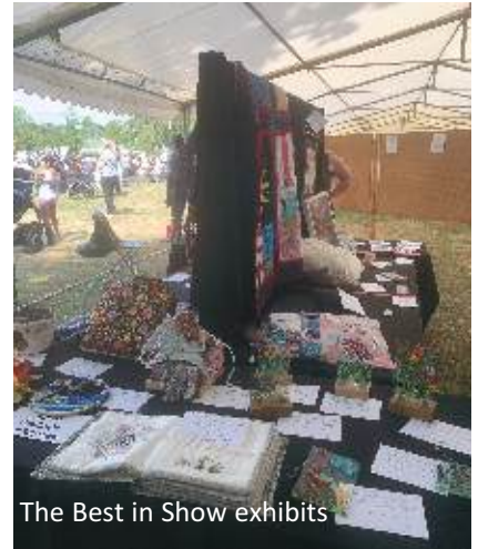
The Best in Show exhibits

Go to the Evington Echo website to see so much of what happened this year. Lots of pictures!