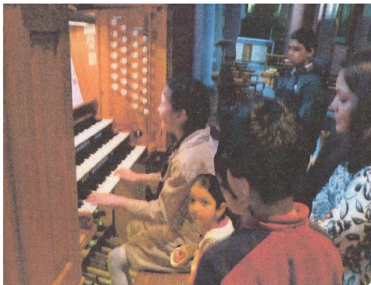
On the organ at St. James the Greater 2009